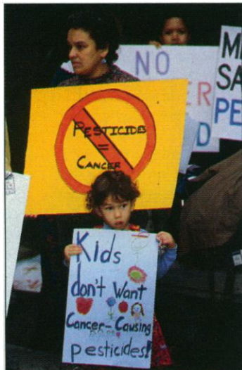
Anxiety epidemic. Protesting risks that may—or may not—be real.